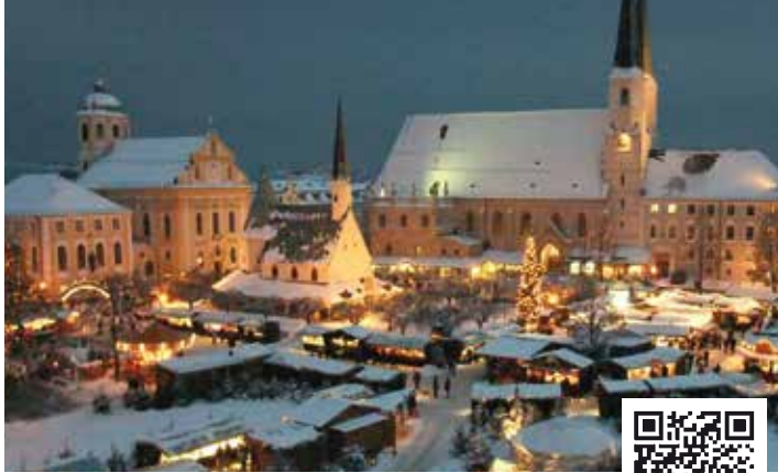
Film about Advent and Christmas in Altötting

Pilgrimage and Tourist Office Kapellplatz 2a, 84503 Altötting Phone +49 8671/5062-19 Telefax +49 8671/5062-54 touristinfo@altoetting.de